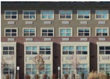
NICOLA STUDENT RESIDENCES

▲ The building uses of high efficiency wall and roof insulation and high efficiency windows.