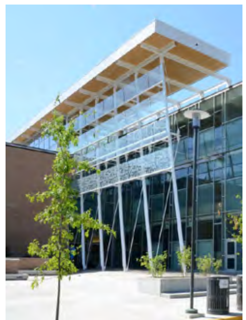
Reichwald Health Sciences Centre