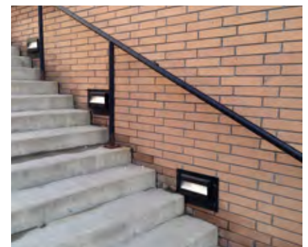
UNIVERSITY CENTRE EXTERIOR

Locally sourced, high-recycled content materials including low embodied energy high fly-ash concrete are used on the exterior.