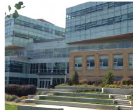
ENGINEERING MANAGEMENT AND EDUCATION LANDSCAPE

▲ The naturalized landscape adjacent to storm water retention pond supports campus ecology and biodiversity.