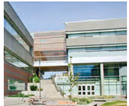
ARTS AND SCIENCES II

▲ The building incorporates passive design strategies including natural/wind driven ventilation, high thermal mass and heat recovery.