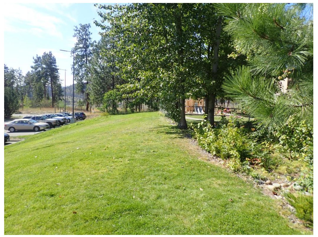
Photo 2. Looking west along the turf/landscaped area to the south of the daycare.