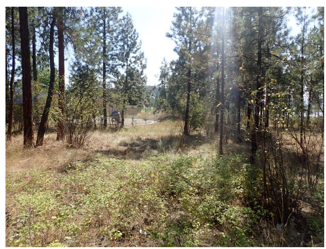
Photo 5. Looking south within Polygon 1 towards the daycare, showing the area where the proposed extension will take place.