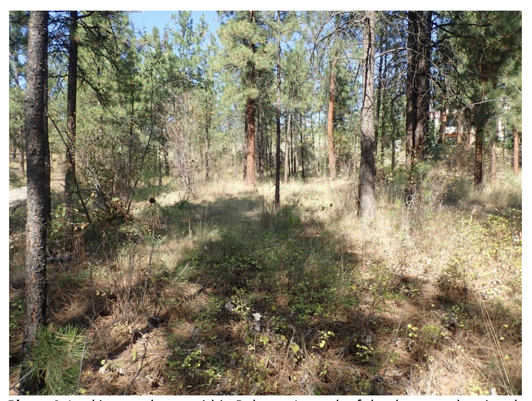
Photo 4. Looking northeast within Polygon 1, north of the daycare, showing the intact PC/04 forested ecosystem.