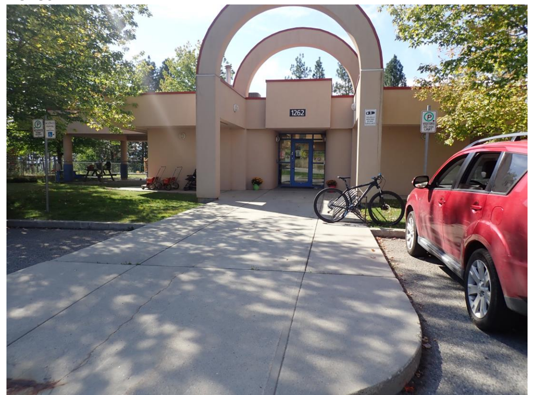
Photo 1. Looking west towards the front of the daycare (photos taken on September 6, 2019).