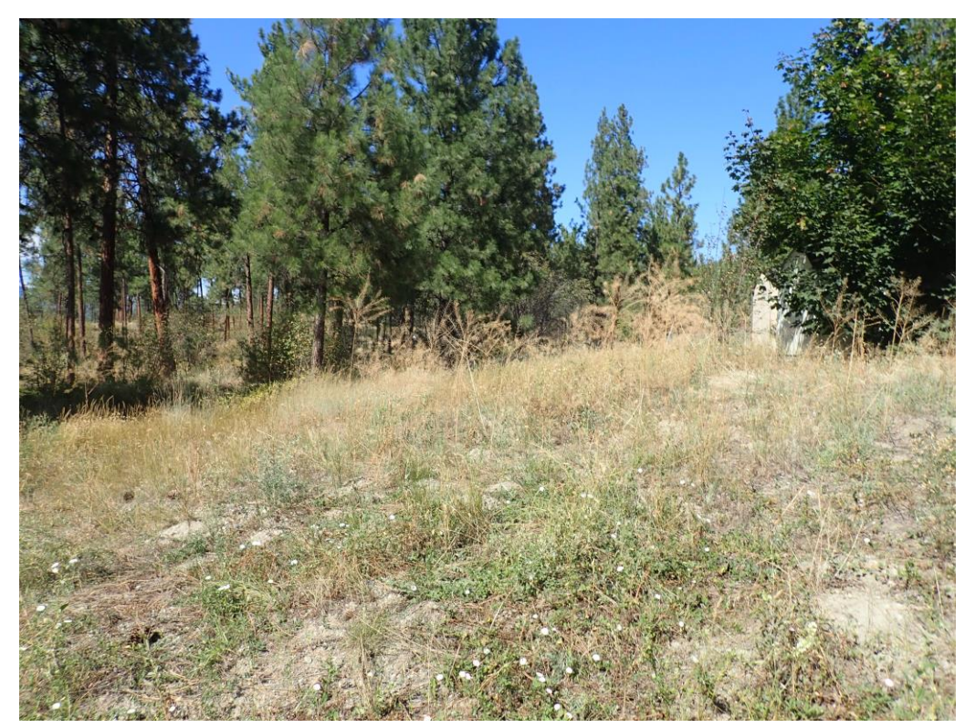
Photo 3. Looking north within Polygon 2, west of the daycare where the proposed extension will take place, showing signs of previous disturbance and establishment of invasive plant species.