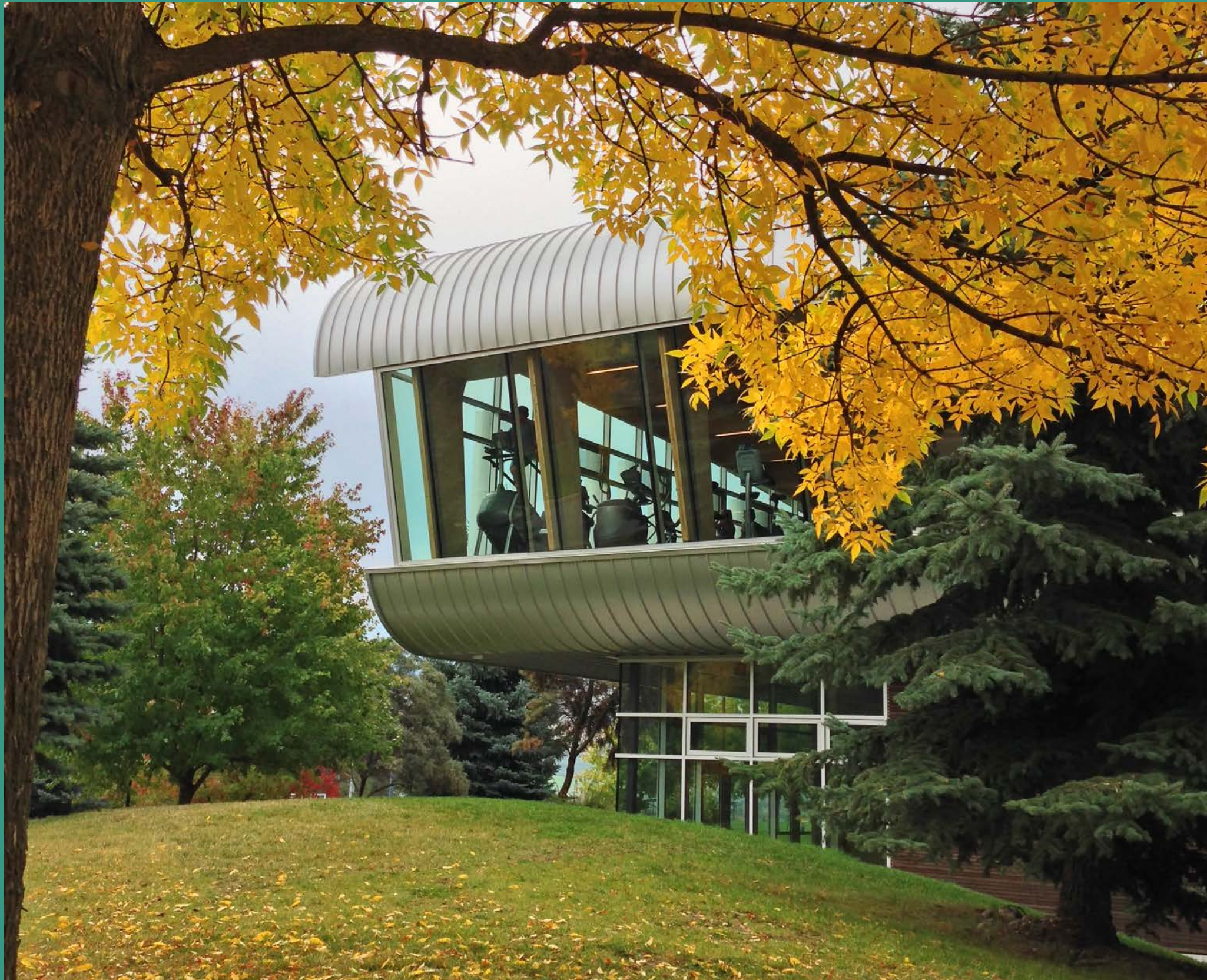
The Hanger Gym Expansion, UBC Okanagan Campus